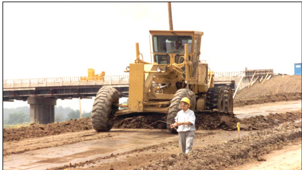
Figure 7-2. Fine Grading

Fine Grading (Figure 7-2) the subgrade for aggregate or asphalt base courses is usually conducted with a motorgrader and checked with a stringline, but may be conducted with an automatic grading machine controlled from a stringline. The automatic grading machine is required to be used for preparing the subgrade for concrete base and pavement. When underdrains are specified, special care is required to be taken to ensure that there is no damage to the drains and that the aggregate backfill does not become contaminated with soil.